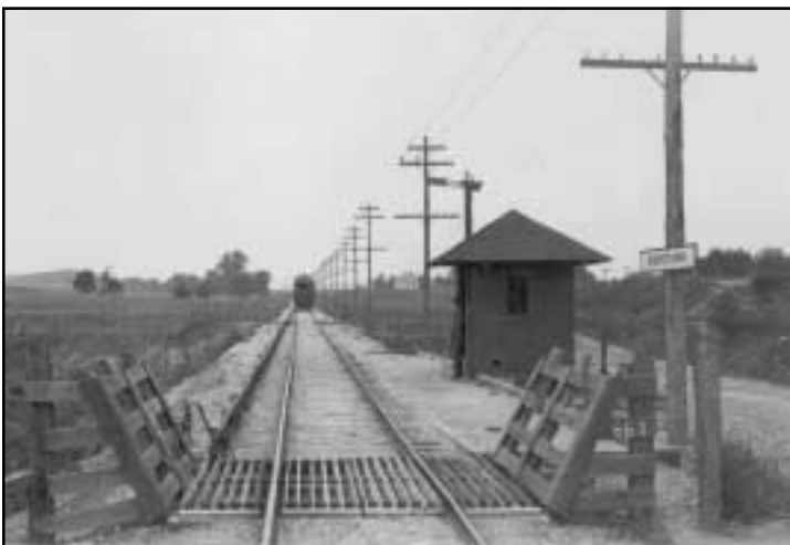
Train near Hopetown, 1915.