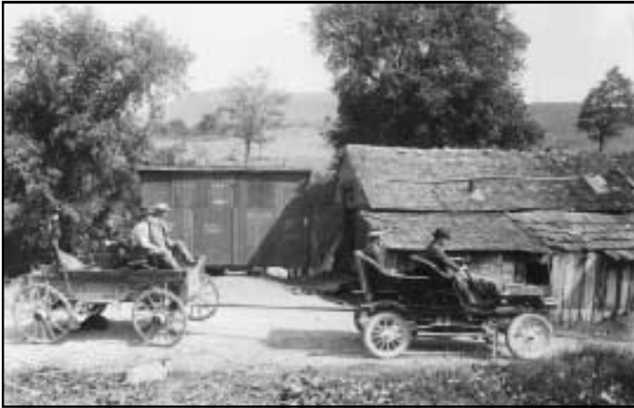
Fertilizer Plant on the Narrows Road c. 1910. Note the dead horse in the back of the wagon.