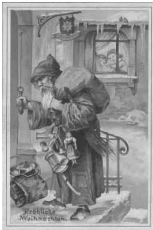
A German Card

The illustrations on this page are from the large collection of 19 th century Christmas cards in the archives.