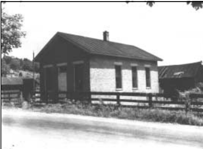
Hopetown one-room School. The school closed in 1950 but is still standing.