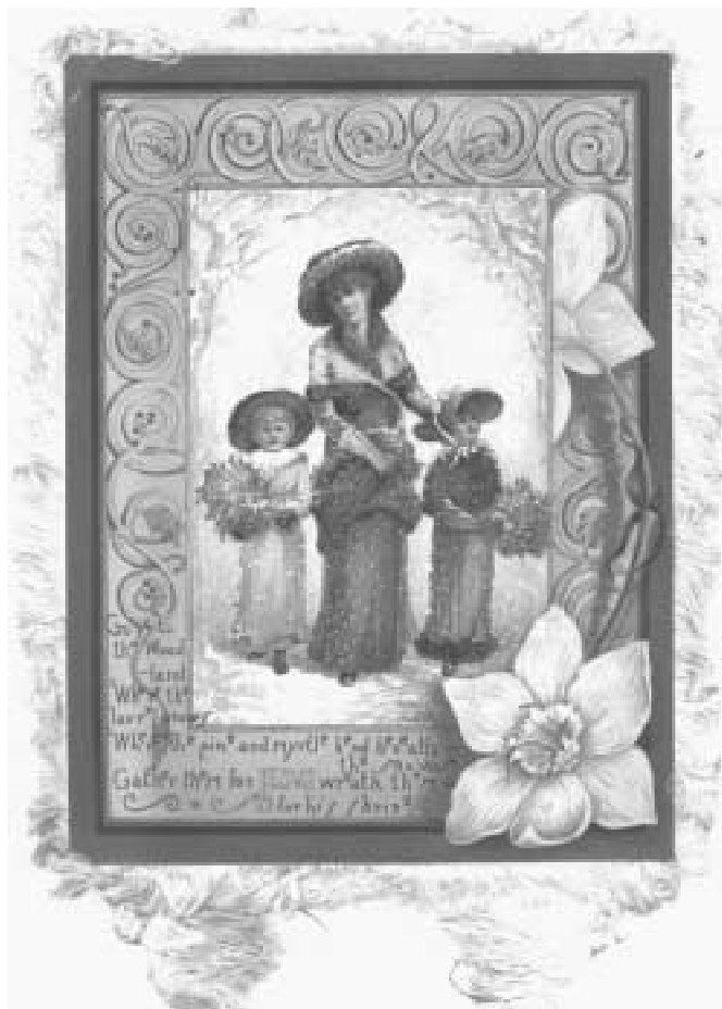
The example above is an 1882 Prang's American Christmas Card by Florence Taber.