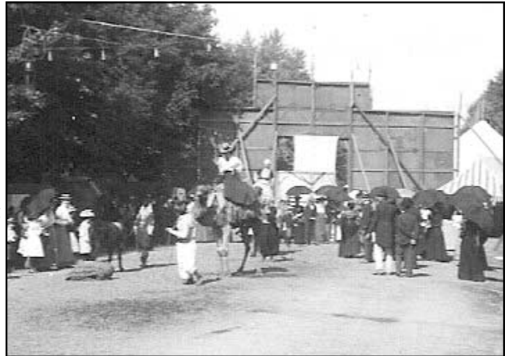
Woman takes a ride on a camel at the street fair

The Street of India offered a "Hindoo priest illustrating some of the peculiarities of his religion," performers showing the sports and pastimes of their native land and Indian magicians, sorcerers, "and other stranger people of a stranger land." One could also enjoy a ride on "Jess" the elephant, or on a camel, donkey, or burro imported from the Far East.