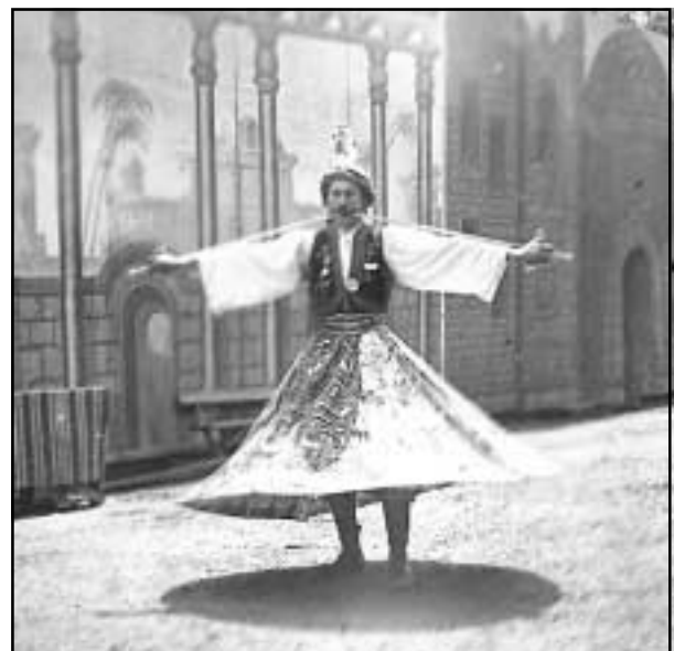
Sword swallower demonstrating his skills

The Japanese Theatre had its own type of entertainment. A group of seven performers represented the Japanese nation with spectacular feats of juggling, tumbling and acrobatics. In some daring tricks, children were tossed and juggled.