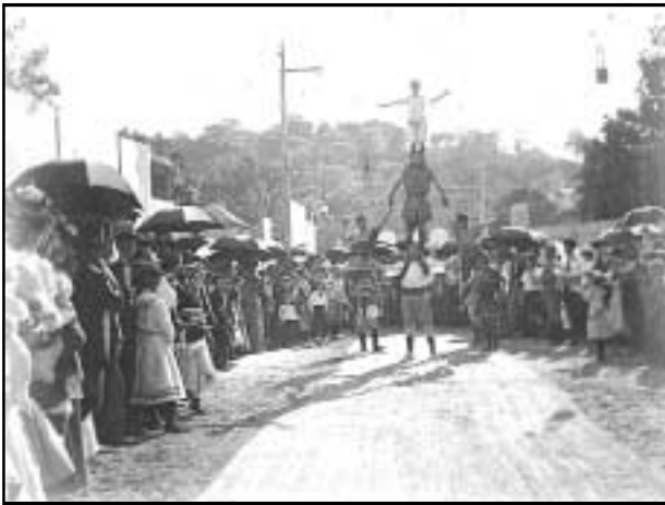
Crowds gather to watch acrobats (Mountain House appears on Carlisle Hill in the background)