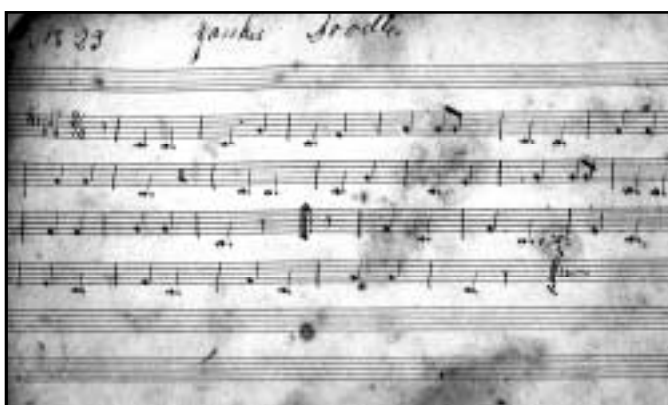
Above is the music for the tune “Yankee Doodle” found in one of four hand-written music books in the Simon Van Pelt Civil War collection (accession # 71).