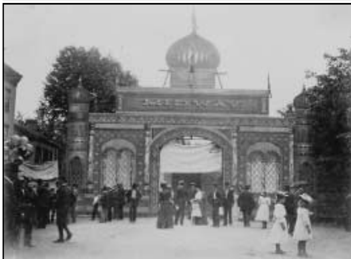
Entrance to the fair at Main and Paint Streets (top) Fair midway on west Main Street (bottom)

The Oriental Theatre offered various entertainments such as "Couchee Couchee" dancing girls dressed in fancy costumes. Turkish musicians playing "their quaint weird music," are accompanied by dancers that are "not sensuous, immoral, repulsive dancers, but marvels of grace and beauty."