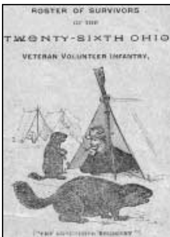
Cover of the Roster of Survivors of the Twenty-Sixth Ohio Veteran Volunteer Infantry, published in August 1901.

The use of articles, photographs, and other items in the Recorder is prohibited without the express written consent of the Board of Trustees of the Ross County Historical Society, 45 W. 5th St. Chillicothe, OH 45601.