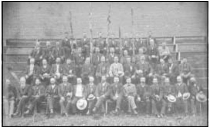
Above is a photo of a reunion of the 26 th Ohio Volunteer Infantry at Chillicothe, August 5 and 6, 1885.

After the war the veterans organized themselves into the 26 th Ohio Association with the purpose of keeping in contact with fellow war brothers. They held annual reunions in towns where companies were organized.